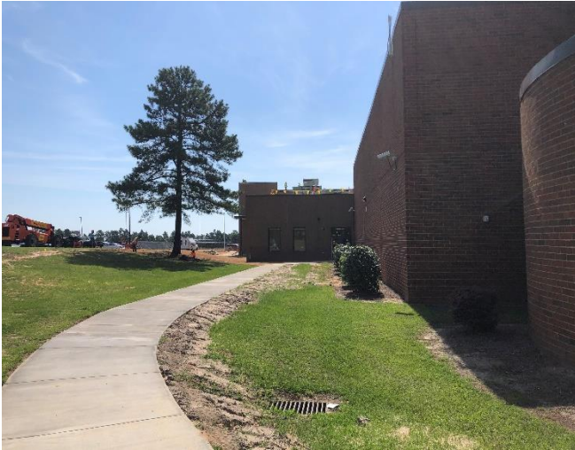
9. Next OAC June 10, 2020 at 10:30 AM.

"The Architect will neither have control over or charge of, nor be responsible for, the construction means, methods, techniques, sequences or procedures, or for the safety precautions and programs in connection with the Work, since these are solely the Contractor's rights and responsibilities under the Contract Documents, except as provided in Subparagraph 3.3-1."